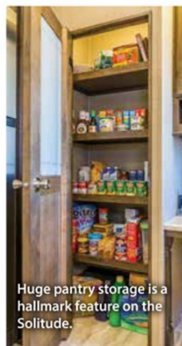
Huge pantry storage is a hallmark feature on the Solitude.