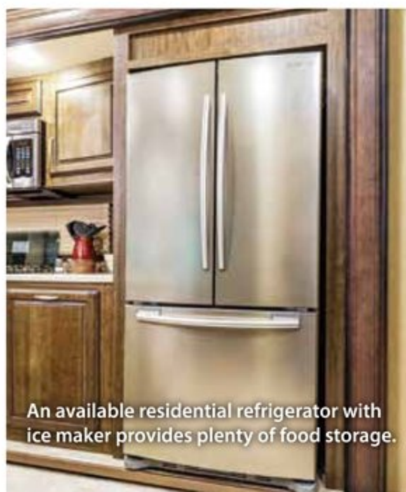
An available residential refrigerator with ice maker provides plenty of food storage.