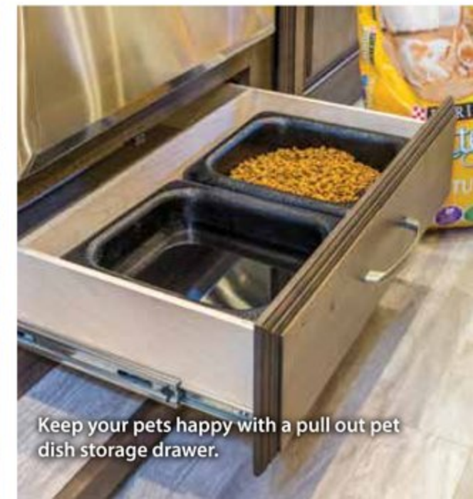
Keep your pets happy with a pull out pet dish storage drawer.