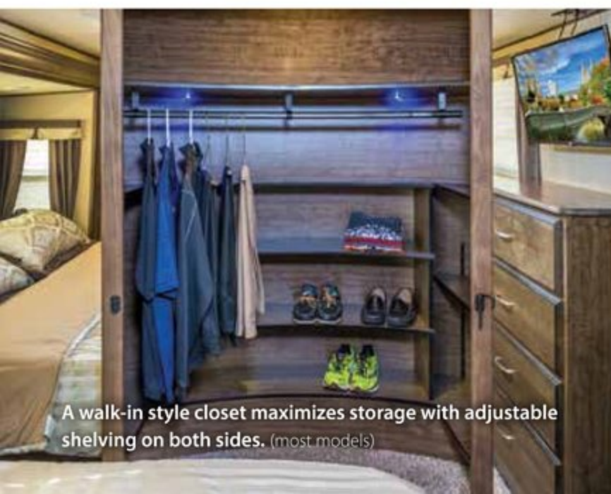
A walk-in style closet maximizes storage with adjustable shelving on both sides. (most models)