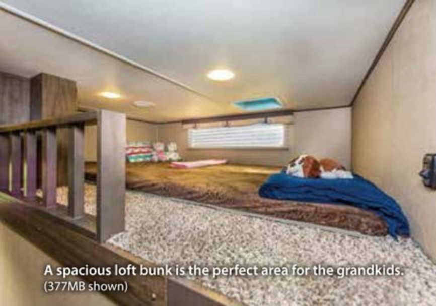
A spacious loft bunk is the perfect area for the grandkids. (377MB shown)