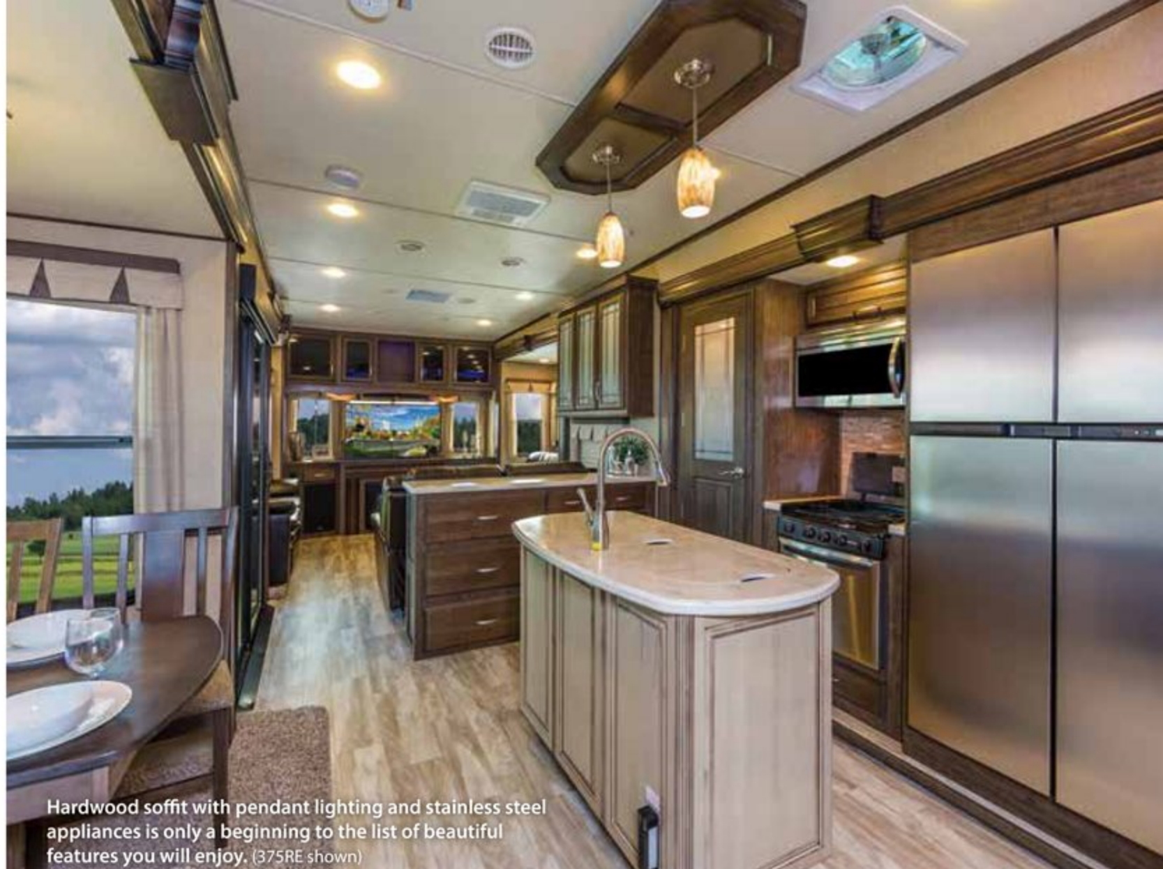
Hardwood soffit with pendant lighting and stainless steel appliances is only a beginning to the list of beautiful features you will enjoy. (375RE shown)