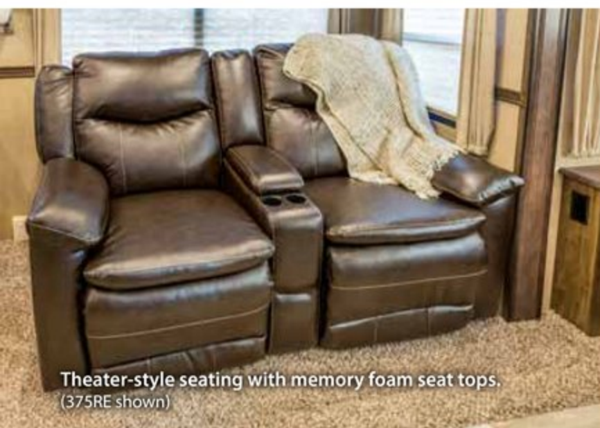
Theater-style seating with memory foam seat tops. (375RE shown)