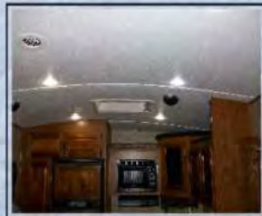
Eco-Friendly LED Interior/ Exterior Lighting