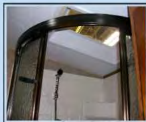
Residential Radius Designed Shower