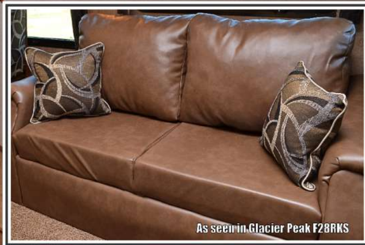
As seen in Glacier Peak F28RKS