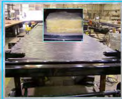
Fully Enclosed Front to Back Heated Insulated Underbelly Double Mountain Floor Insulation