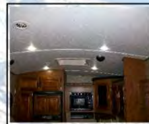
Vaulted 5' Radius Ceiling w/ Crown Molding