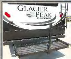
Bumper Storage Rack (Standard)