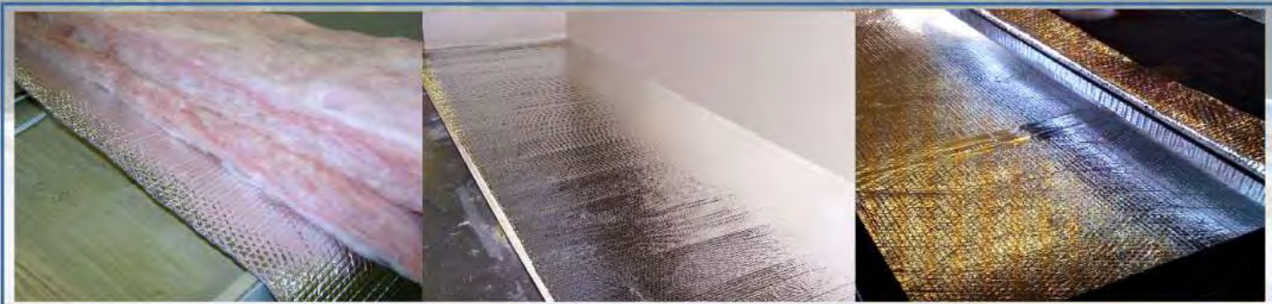
R-15 Astro-Foil Roof, Slide-Out Floor, Entire Underbelly, Additional Wrap Around Holding Tanks

**materials designs and specifications are subject to change without notice