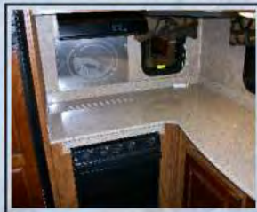
Sunken Range w/ Cover