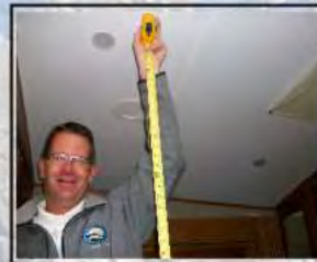
Height at End of Bed 6ft 7 inches