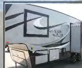
Silver HG Lamilux 4000 Fiberglass