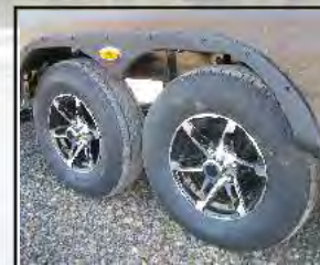
Standard Goodyear 235 10 Ply Tires w/ 6,000lb Axles