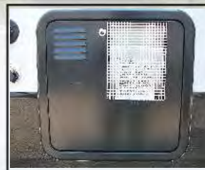
10 Gallon LP/110V Water Heater