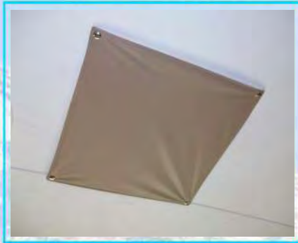
Insulated Snap Cover for Select Roof Vents (Model Specific)