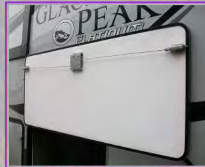
1" Thick Thermal Insulated Luggage Door Compartments