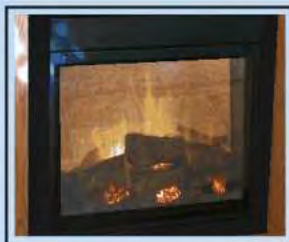
Living Room Fireplace (Optional)