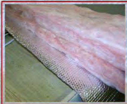
Triple Layered Four Seasons Roof Insulation