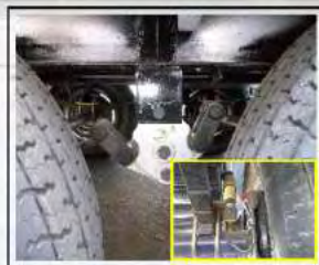
Custom Built Cambered Off Road Chassis - HD Shock Absorbers Plus Rubberized Suspension