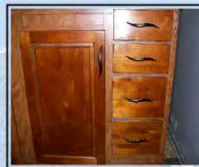
Solid Wood Drawer Fronts