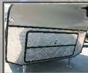
Diamond Plate Bulkhead Protection