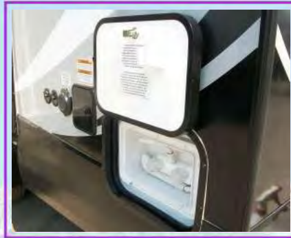
Exterior Shower Insulated by 1" Thick Thermal Insulated Luggage Door