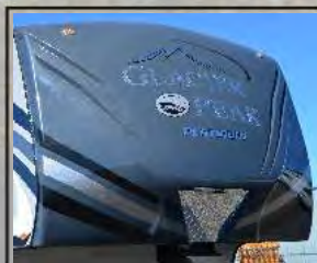
Charcoal HD Fiberglass Front Cap w/ Lights