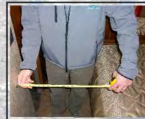
Extra Room at End of Bed 20 inches