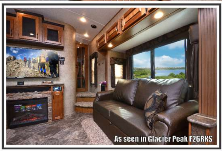
As seen in Glacier Peak F26RKS