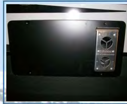
15% Larger XL Furnace (Extreme Camping Heat System)