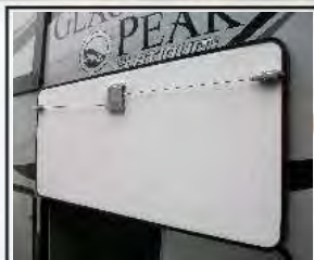
"Mountain Sized" 50% Larger Exterior Luggage Door Opening w/ Pull Out Table