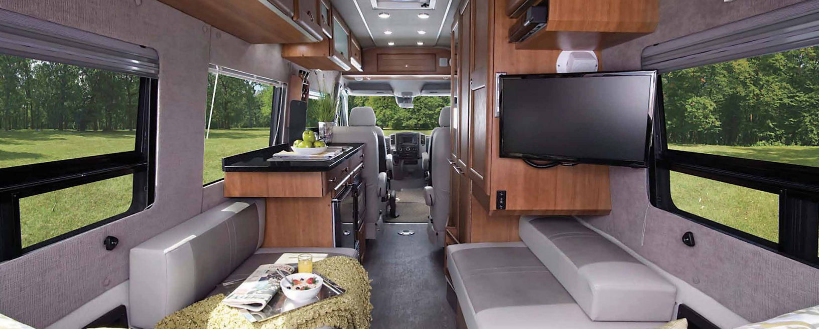
Spacious and comfortable rear lounge area features a home theatre system with 24" TV and 5.1 surround sound and speaker system.