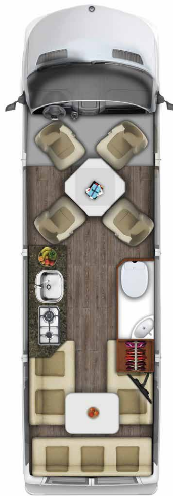
Interior floor plan daytime.