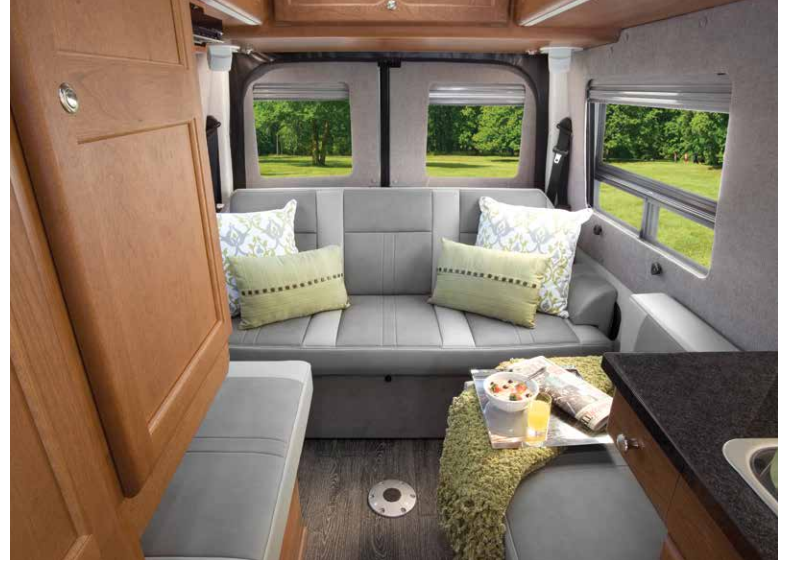
Main lounge offers a comfortable place to sit and relax and seating for up to three passengers.