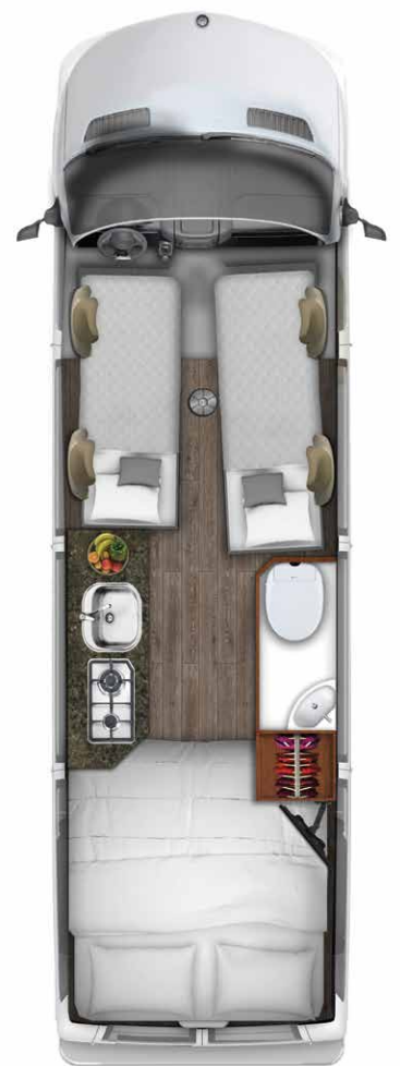
Interior floor plan evening.