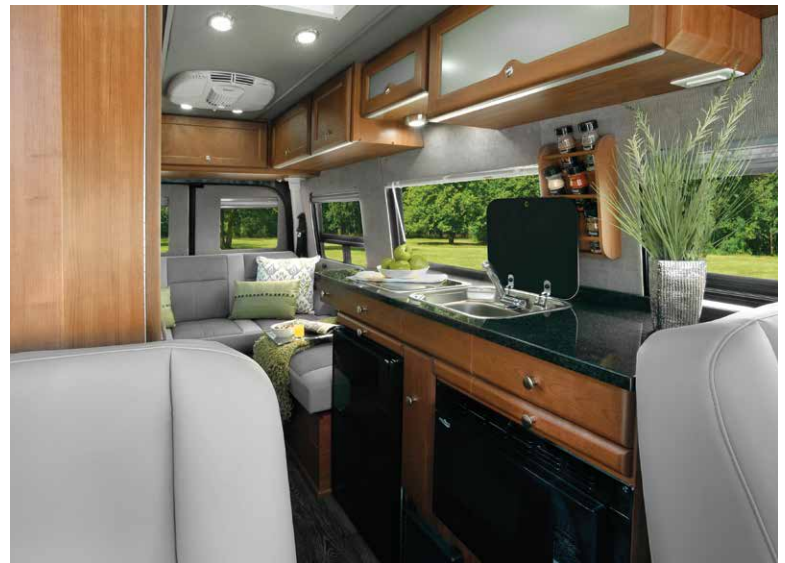
Expanded galley features a 3.1 cu. ft. refrigerator, convection microwave and 2-burner propane stove.