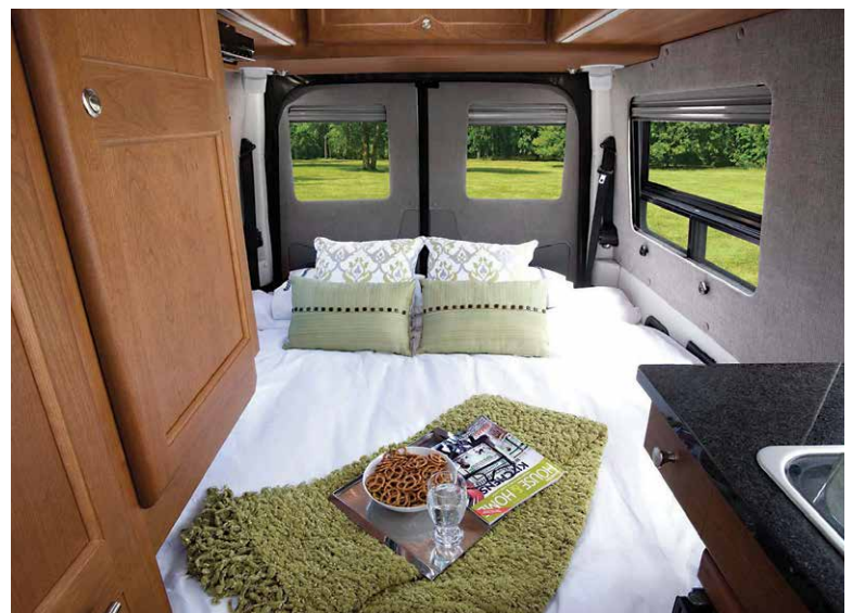
Rear lounge area easily transforms into a sleeping area with a comfortable king size bed.