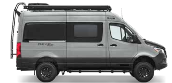
SILVER GREY WITH RAPTOR®

Other exterior colors available are: Selenite and Stone Grey. See website for more details.