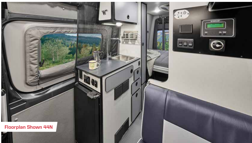
Floorplan Shown 44N