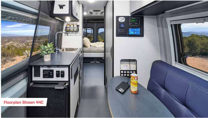
Floorplan Shown 44C