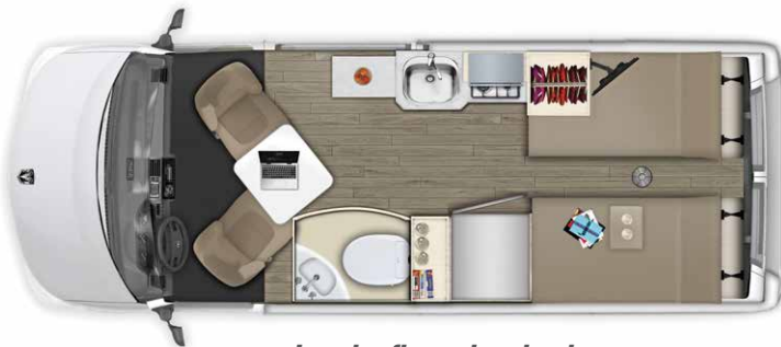
Interior floor plan daytime.