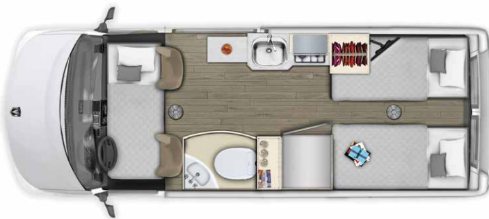
Interior floorplan evening with twin bed set up. (Shown with optional front folding mattress.)