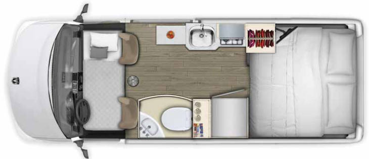
Interior floorplan evening with king bed set up. (Shown with optional front folding mattress.)