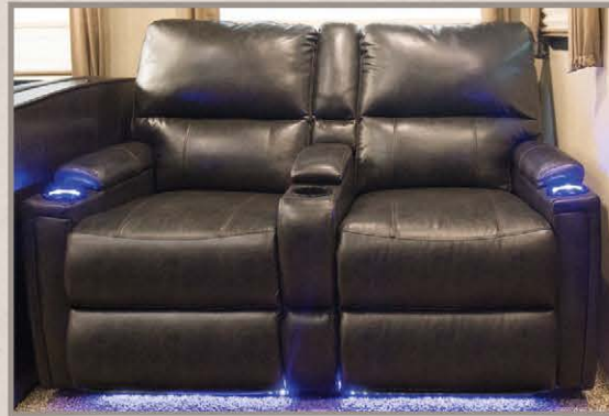
Heated wall hugger theatre seats w/ massage and led lights