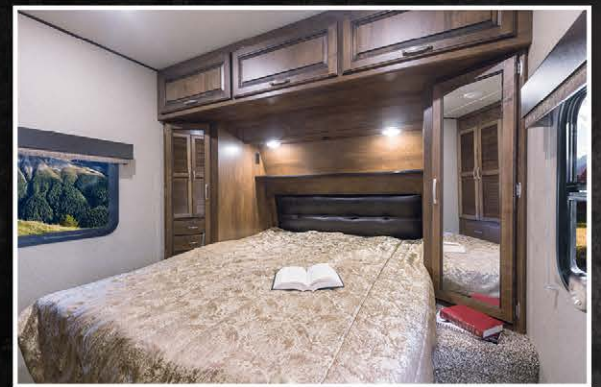
Residential Master Suite (297RSTS Shown)