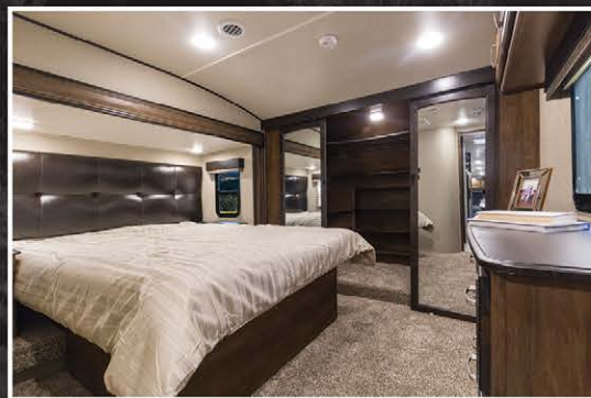
Residential Master Suite (Bed slide models shown)