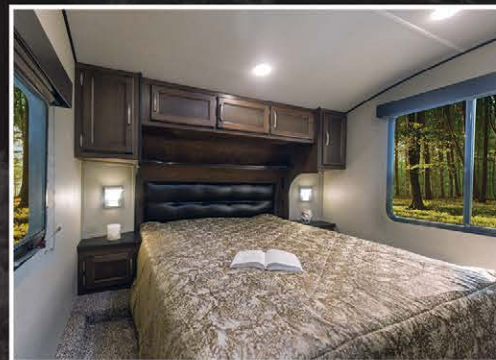
Residential Master Suite (230RL Shown)