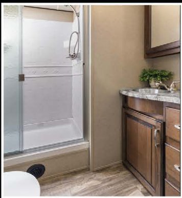
Spacious Master Bath (315RLTS Shown)