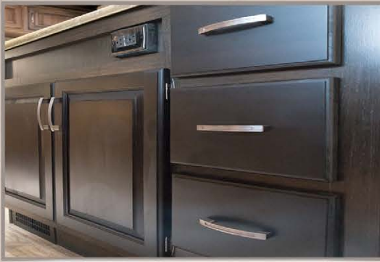
Kitchen island with bank of drawers