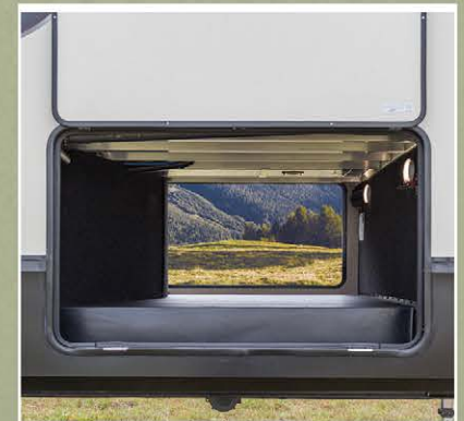
UNOBSTRUCTED PASS THRU STORAGE Clean storage area with slam latch baggage doors and magnetic catches.