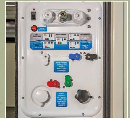
UNIVERSAL DOCKING STATION All-in-one heated location with EZ winterization system and exclusive siphon feature (Fresh tank)