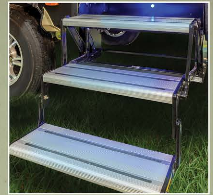
ALUMINUM ENTRY STEPS 100% Aluminum, easy open... won't rust or bind.