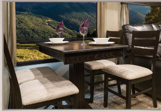
Free standing dinette w/2 folding chairs