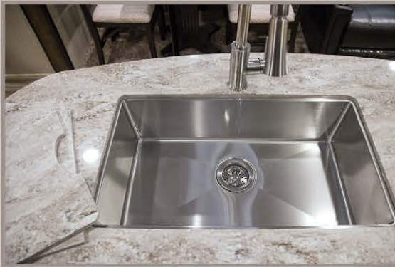
Deep seated stainless steel farmers sink