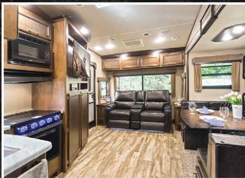
Spacious Living/Galley Area (230RL Shown)