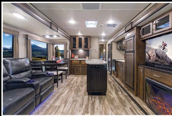
Spacious Living/Galley Area (297RSTS Shown)