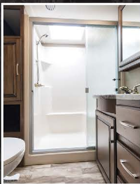
Spacious Master Bath (Bed slide models shown)

Nev-R-Adjust brakes, bronze bushings and wet bolts, rubberized suspension equalizer