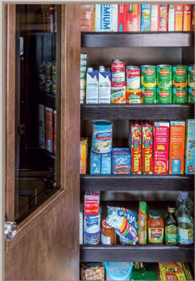
Class leading pantry storage