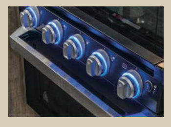
Sonic features a glass-topped, flush-mounted, 3-burner cooktop with oven.