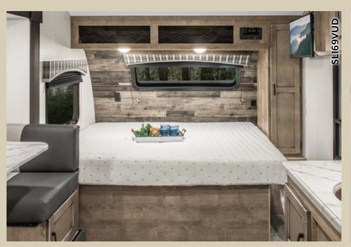
Sonic Lite bedrooms feature overhead storage, full-length shirt closet and StorMore nightstands with 110V outlet and USB charging port.

and cabinets with mortise and tenon hardwood cabinet doors.