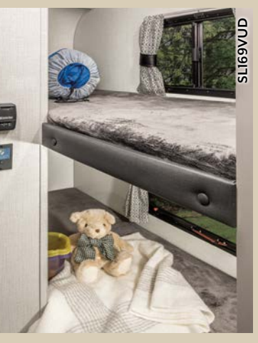
Double bunk floorplans offer Teddy Bear bunk mattresses, and each bunk has its own window.