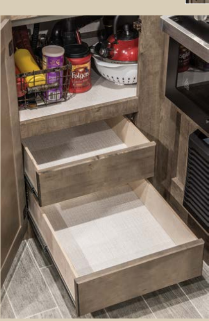
Sonic kitchens features a glass, flush-mounted, 3-burner cooktop with oven, microwave, exhaust fan, 7 CU FT refrigerator, and deep stainless steel single-bowl sink with draining rack.