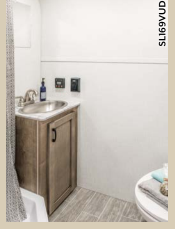
Bathrooms include porcelain footflush toilet, tub or shower surround and skylight.