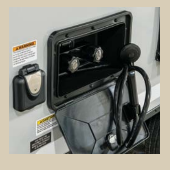
Standard outside shower provides both hot and cold water.