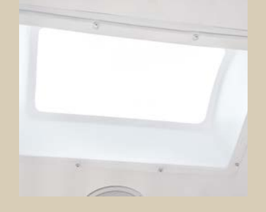
Skylight offers plenty of light and headroom.