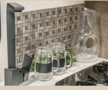
Designer backsplash enhances the interior.