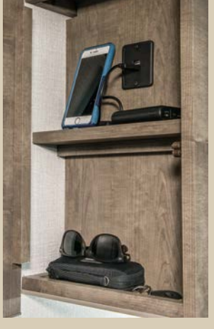
Safe Tek box provides a hidden charging station with USB and 110V outlets.